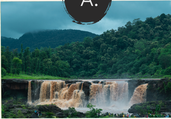
GIRA WATER FALL